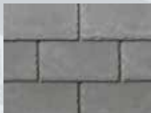
CR-731 Ash Grey