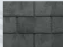
718 Grey/Black Blend