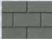
815 Sage Green