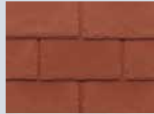
709 Brick Red