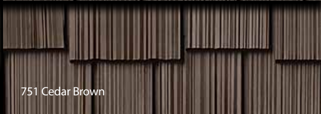
751 Cedar Brown