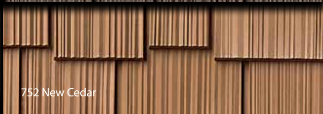
752 New Cedar