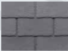
803 Mist Grey