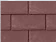
809 Red Rock

Please note: Traditional Slate Colours are stocked in our warehouse. Actual colours may vary from printed representation, samples are available on request.