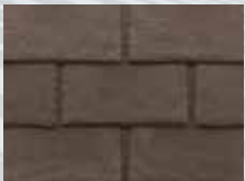
712 Chestnut Brown