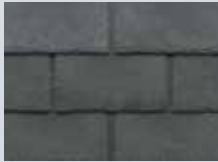
804 Pewter Grey