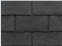
801 Stone Black